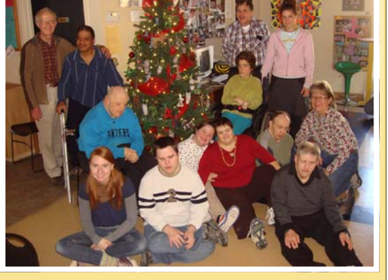
It looks like respite clients and workers – who had just finished decorating the tree – might be waiting for Santa Claus. If so, they weren't disappointed. This year, the big guy arrived on a regular respite day after a special Christmas lunch, then dispensed gifts with more than a few "Ho Hos."