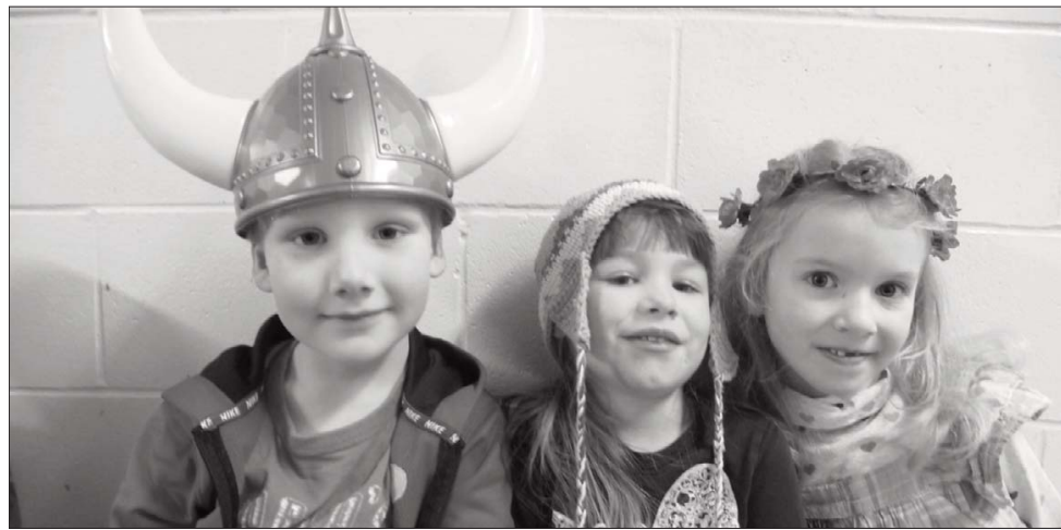
Wear a hat indoors to raise money for Syrian families