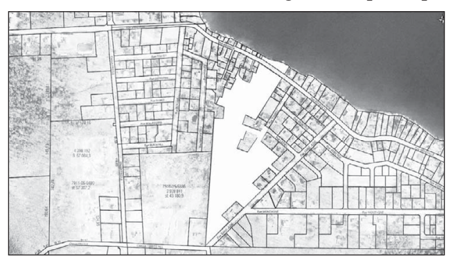
Aerial view of the 13-acre lot acquired by the Town of Brome Lake

The transaction relies on the generous participa-