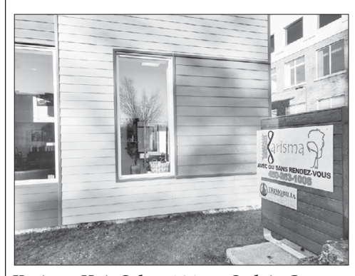
Karisma Hair Salon, 304 rue Sud, in Cowansville has had a steady stream of customers since reopening after the Covid shut-down.

The time sanitizing between customers is not taking as long as when