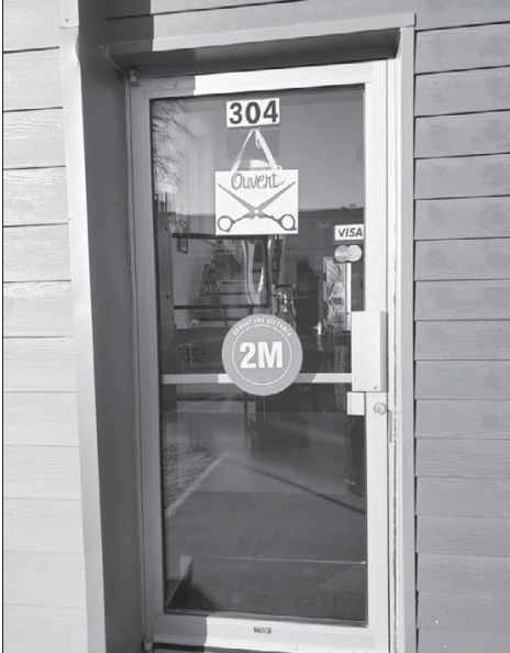
As you approach the salon, notices on the door remind customers of social distancing and mandatory mask wearing.