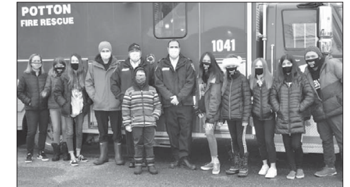
Basket delivery for firemen