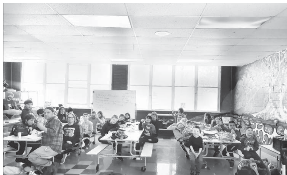
MES outdoor fun day lunch

For more information about the youth programs of the CABMN visit: www.cabmn.org or call 450-292-4886. While the regular programming is currently suspended due to Covid, the Youth Centre staff are finding other ways to stay connected with the youth until the programs resume. While visiting the CABMN website, visitors are encouraged to sign up for their free weekly newsletter. The newsletter will keep you informed of events, group information and government directives during the pandemic.