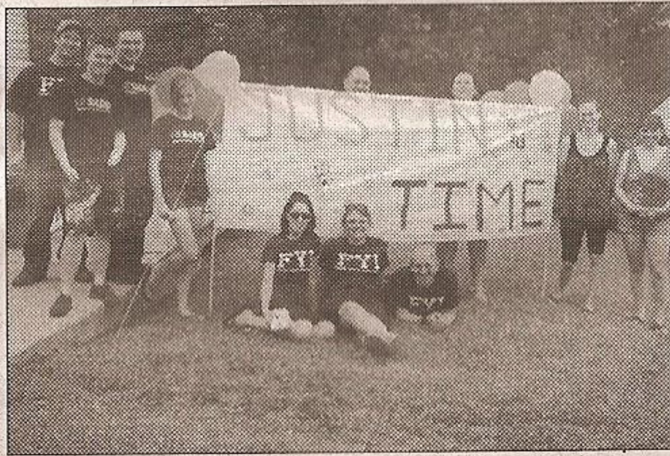
Waiting for Justin gathered around big banner of front lawn

On Tuesday, youth from the Missisquoi North Volunteer Centre (CAB) in Potton honored several community members for their longtime contribution to the betterment of Potton Township as well as one member from outside Potton who has made great efforts in supporting youth from the area for many years. The awards were held as part of the Justin Hines Vehicle of Change Tour celebration which made a stop at the Missisquoi North Youth Centre in Mansonville on Monday where Justin and his crew stayed for the day and then performed an outstanding concert in the evening. The youth centre was truly honored to be one of the stops on the tour. Below are the honorees.