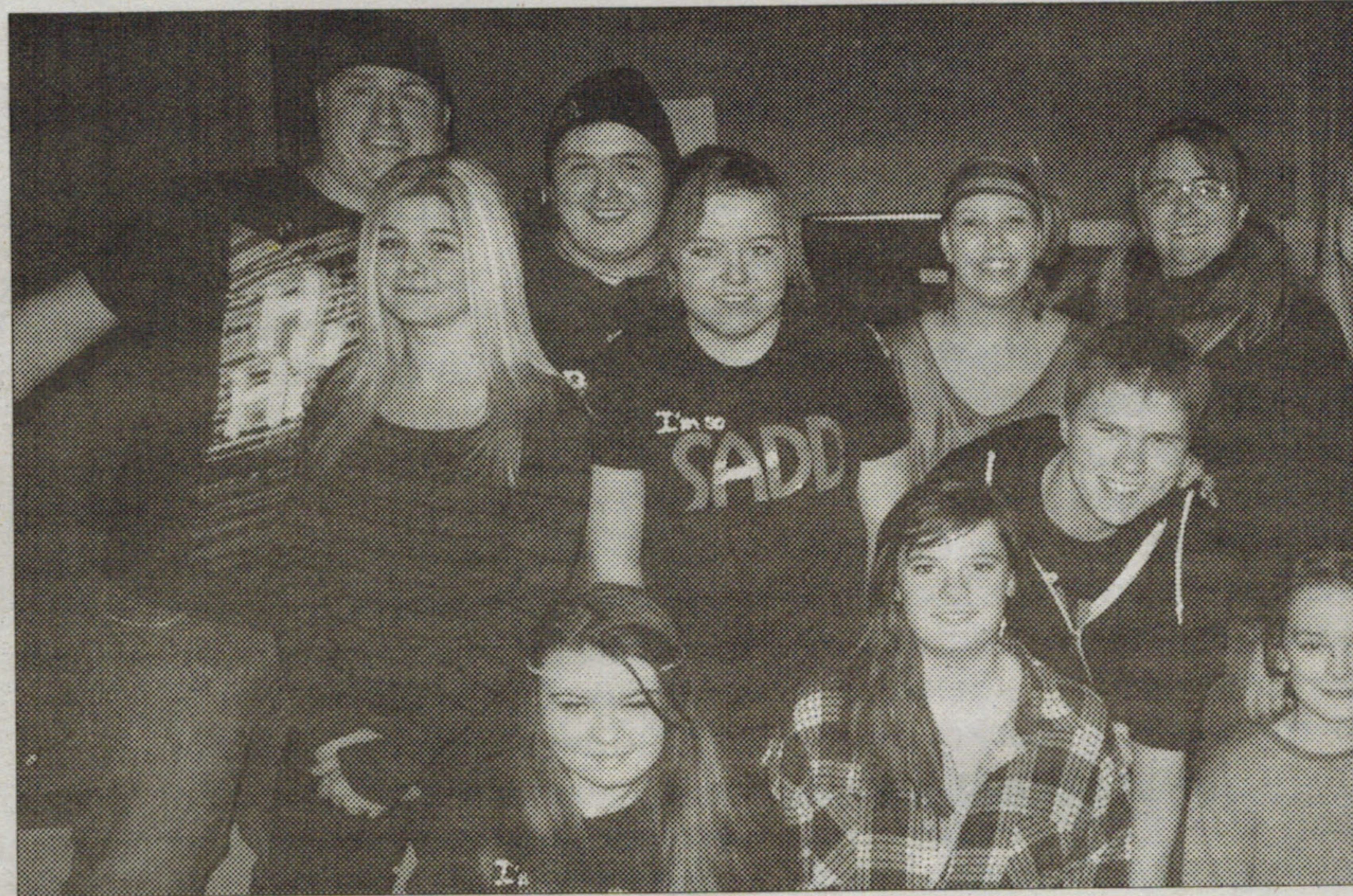
Parents and volunteers who organized the "Ecole du Baluchon fundraiser" event at Mansonville chapter who helped out during the dance.

The rosy cheeks of the kids who danced non-stop were the best indication that this had been a wonderful and memorable evening.