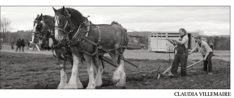
Nearly a dozen teams furrowed the ground in Bishopton last week.