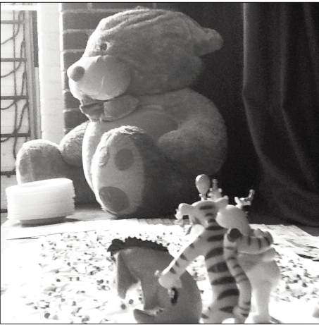
A teddy bear picnic was held in the gym of K.A. a few weeks ago to celebrate the Winnie the Pooh books' 100th birthday. Everyone brought their teddy bears and favourite blanket and listened to the story of how Winnie became such a famous bear. What a fun picnic it was complete with two gorgeous cakes made by our very own. All the bears and all children had a wonderful picnic.