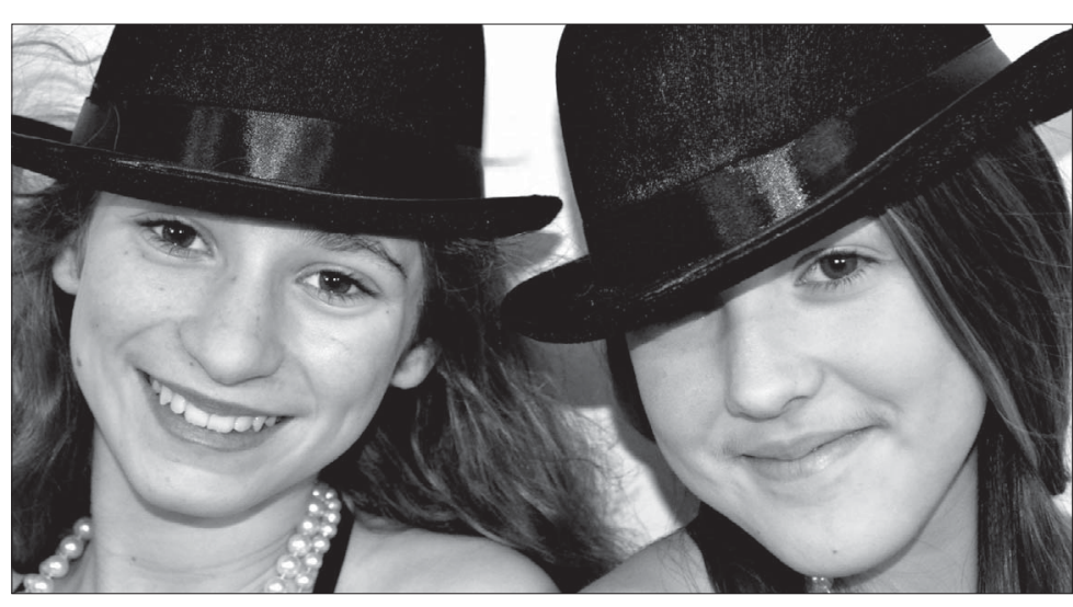
Friends at the Friday night Drop-in group pose for the camera