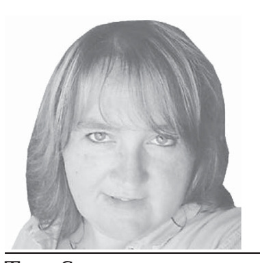
THE SCOOP MABLE HASTINGS

he Municipality of Potton inaugurated its multifunctional shelter and centerpiece of the Missisquoi-North Park in November of 2020. In 2021 major improvements were ongoing to the playground and park in general that is located at the northern entrance to the village of Mansonville.