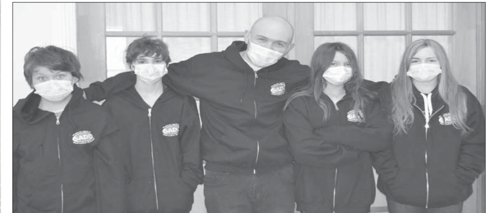
New SADD members for Mansonville Students Against Destructive Decisions