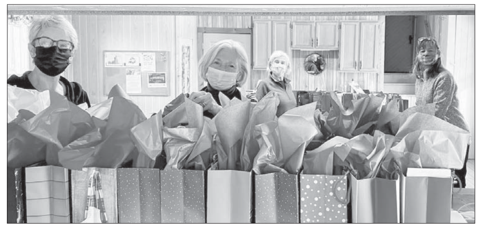
Acts of Love volunteers