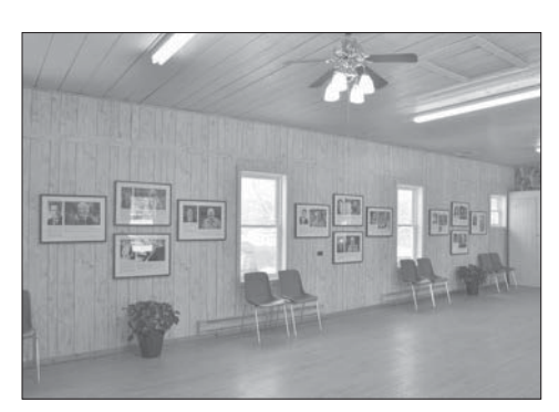
New windows at Senior Centre

wo weeks ago, new doors and windows were installed in the Missisquoi North Volunteer Centre (CABMN) Feather in the Wind Senior Centre in Potton located at 309 Principale. The former St. Paul's Anglican Church building and adjacent hall were purchased by the non-profit organization last February. The priority being upgrading the "hall" portion of the building to create a warm, welcoming and useful space for Potton and area seniors to call their own. A space where seniors take priority and where activities for them are at the forefront