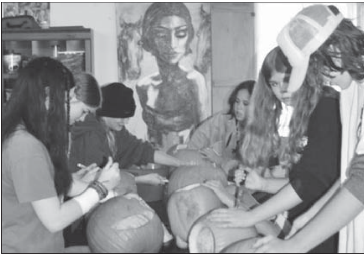
The youth carving pumpkins for Halloween