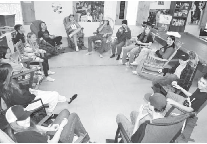
Youth rocked for four hours at Last Saturdays Annual Rock-a-thon fundraiser to support SADD and Leadership events and raised $3,400!

Drivers are reminded to use caution on Halloween night as the weather is often poor and ghosts and goblins come in all shapes and sizes wearing cumbersome costumes, filled with hasty excitement and not always paying full attention. The best Halloween is a safe one.