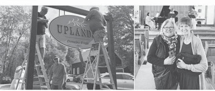
Uplands Cultural and Heritage Centre : 9 Speid, Sherbrooke (Lennoxville) www.uplands.ca

Celebrating Volunteer Appreciation Week Every Moment Matters, Thank You!