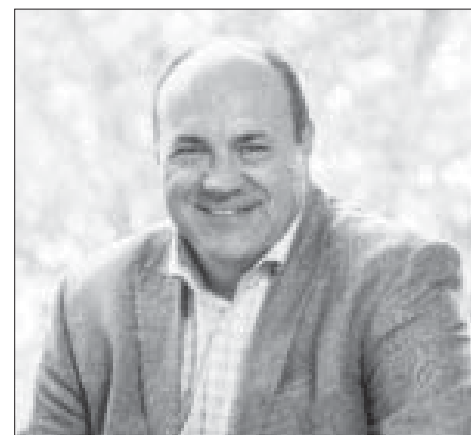
Yvon Laramee, Mayor of the Municipality of Eastman